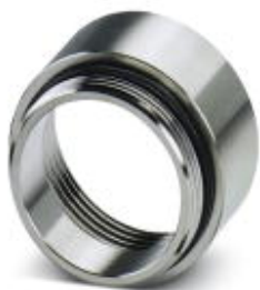
NPT adapter, IP68, up to 5 bar, incl. O-ring seal, M40 to 1 1/4"

Please be informed that the data shown in this PDF Document is generated from our Online Catalog. Please find the complete data in the user's documentation. Our General Terms of Use for Downloads are valid ( http://phoenixcontact.com/download )